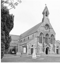
St. Mary & St. John Station Road