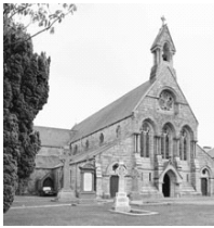
St. Mary & St. John Station Road