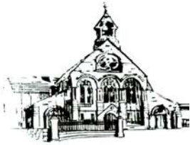
St. Mary & St. John Station Road