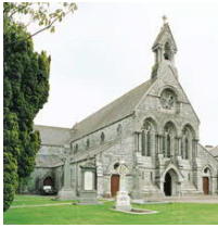
St. Mary & St. John Station Road