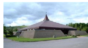
Christ Our Light Innishmore

Peter, who denied the Lord three times, three times, affirms his love. He learns that his share in the Lord's care for his people will one day bring him to the martyrdom of death - the early Church was founded on those who joyfully bore witness with their lives.