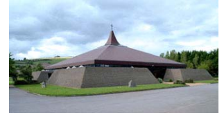
Christ Our Light Innishmore

Today we face the greatest mystery of our faith, the mystery of how God works among us, bringing new life where before there was only death. With a sense of wonder and with joy, we come today to thank God for the risen life of Jesus.