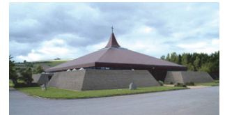
Christ Our Light Innishmore

God comes to those who wait for him. Our waiting needs to be prayerful if we are to be truly ready to receive him when he comes.