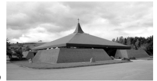
Christ Our Light Innishmore

God has given to each of us a potential to be developed. There is a promise in us yet to be fulfilled. Jesus came to bring this fulfilment to everyone and it will be ours when we follow like Peter and the others who lived in Galilee.