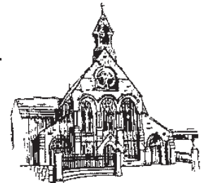
ST. MARY & ST. JOHN STATION ROAD