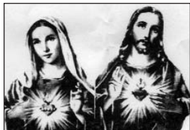
The Sacred Heart of Jesus and The Immaculate Heart of Mary