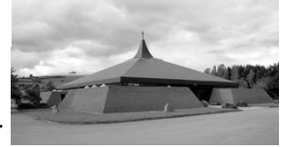
Christ Our Light Innishmore

The gift of speech is a tremendous power, but it can be used for good or evil. As a rule, our speech reflects the kind of person we are: if we allow Christ's victory to dominate our lives, then our speech will be kindly, tolerant and non-judgemental.