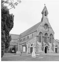
St. Mary & St. John Station Road