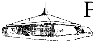
CHRIST OUR LIGHT INNISHMORE