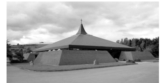
Christ Our Light Innishmore

Christmas Day A child is born for us, a son given to us; dominion is laid on his shoulder, and he shall be called Wonderful Counsellor.