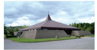
Christ Our Light Innishmore

Jesus lamented the fact that the 'children of light' are not as astute at doing good as the wicked are at looking after themselves. It may be that some of our ineffectiveness in doing good arises from a lack of total commitment to God. We cannot have it both ways; self- concerned and love of God don't mix.