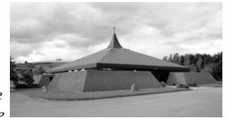
Christ Our Light Innishmore

By its nature, the Church is missionary. Christ sent her to let her light shine to the whole human race. We cannot leave this task to the professionals. The prophets and the apostles were ordinary lay people when chosen to speak and act in God's name. As the result of our baptism, each of us has a duty to work for the missions in our special way and in our own particular place.