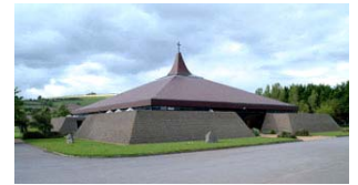
Christ Our Light Innishmore

Like Paul and Barnabas, those whose vocation it is to preach the gospel, will meet opposition. Today we are encouraged by the thought that the Christ we serve knows his people intimately and promises them eternal life--no opposition can snatch them from the Father's love.