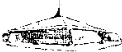
CHRIST OUR LIGHT INNISHMORE