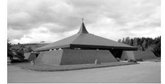
Christ Our Light Innishmore

John the Baptist was sent by God to prepare for Christ's coming. His task was to make them attentive to the Spirit who would be fully present in God's anointed.