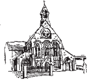
ST. MARY & ST. JOHN STATION ROAD