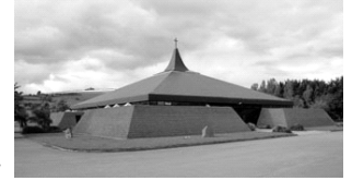
Christ Our Light Innishmore

Christian hope overcomes the fear of death. God is faithful: not only does he strengthen us against evil in this life, but will give eternal life to all who try to imitate his faithfulness.