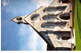
St Mary and St. John

This is the day the Lord has made; let us rejoice and be glad.