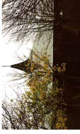
Christ Our Light