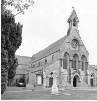
St. Mary & St. John Station Road