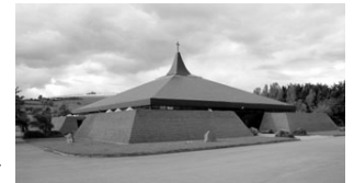
Christ Our Light Innishmore

As we begin Lent again, we learn that we need to be purified of our sins. Jesus went out into the desert to be put to the test for us, to overcome Satan. If we go into the desert with him, whatever is evil in our lives can be overcome.