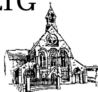
ST. MARY & ST. JOHN STATION ROAD