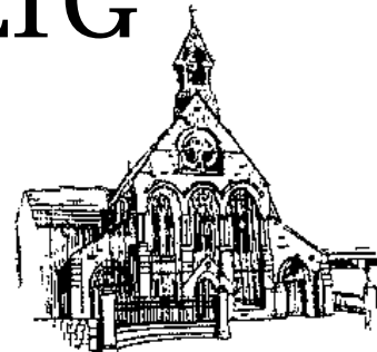
ST. MARY & ST. JOHN STATION ROAD

SUNDAY 29TH APRIL 2001 THIRD SUNDAY OF EASTER